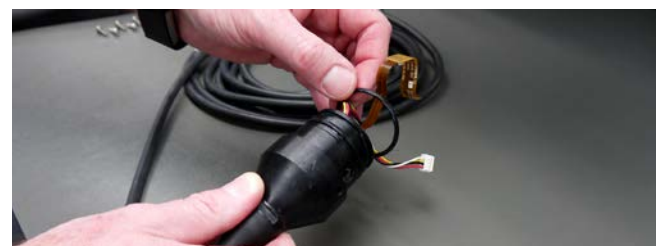
Cable/probe assembly seal replacement.