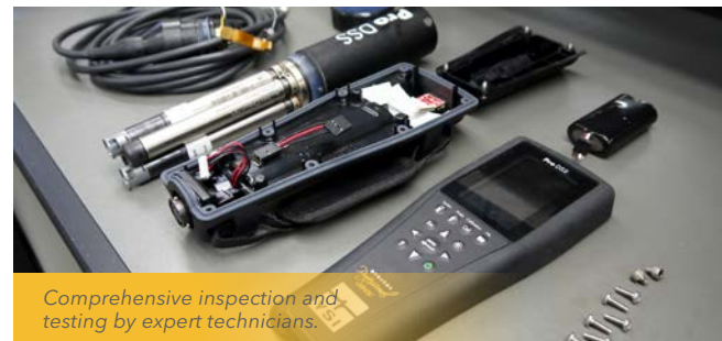
Comprehensive inspection and testing by expert technicians.