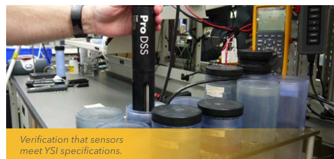
Verification that sensors meet YSI specifications.