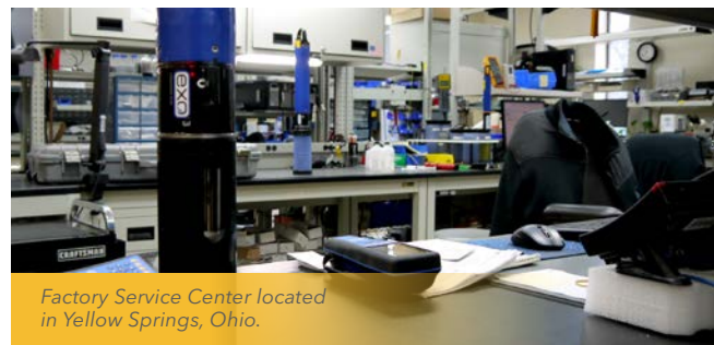
Factory Service Center located in Yellow Springs, Ohio.